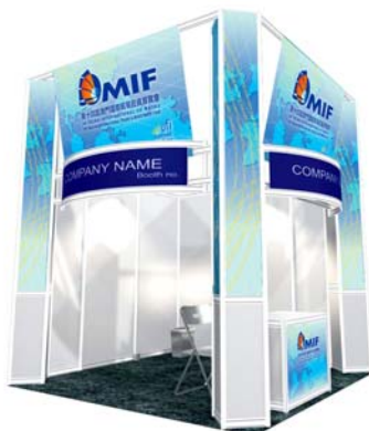
(3x3)M 高級標準展位 B (雙面入口效果圖) (3x3)M Premium Booth B (Two Sides Open)